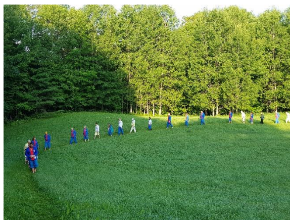
Walking the microcosmic orbit