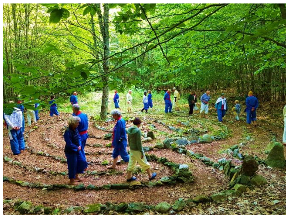
Walking the labyrinth