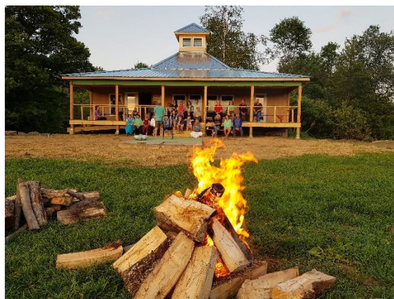
Before the gala