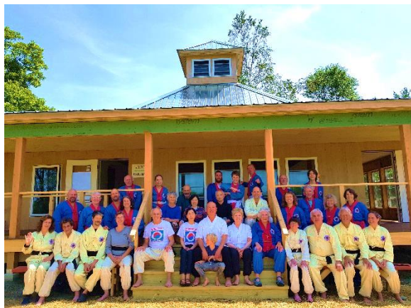
The group