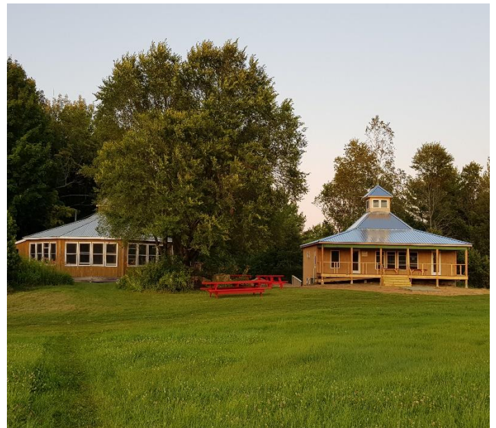
Meditation hall and new building

Phase 1 has been completed! Special thanks to Ron Walesch who put together a team to do the final work on Phase 1. Now we are about to begin Phase 2, which we hope to have completed by the end of 2019. Phase 2 includes rough plumbing, water line, waste line to the septic tank, venting rough ends, insulation, and electrical rough ends.