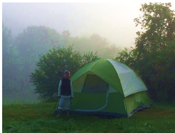
Tora at dawn