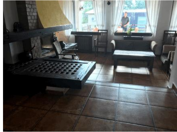
Cold Mountain Lounge Area