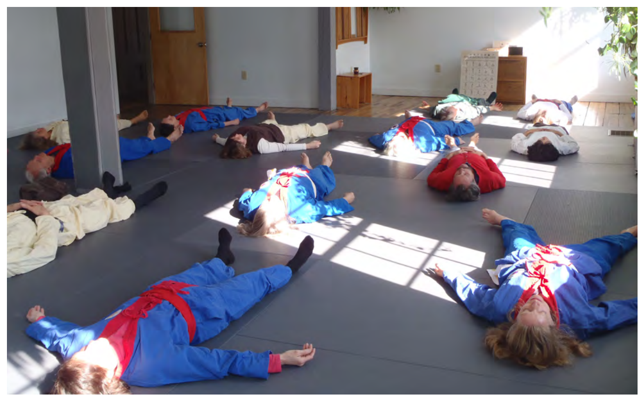
Ah, sunshine on a winter's day, Montpelier Center, February 2012.

The moon sets, lighting my porch, probing dark lamps. Blossoms drift through the door, smile on my empty bed.