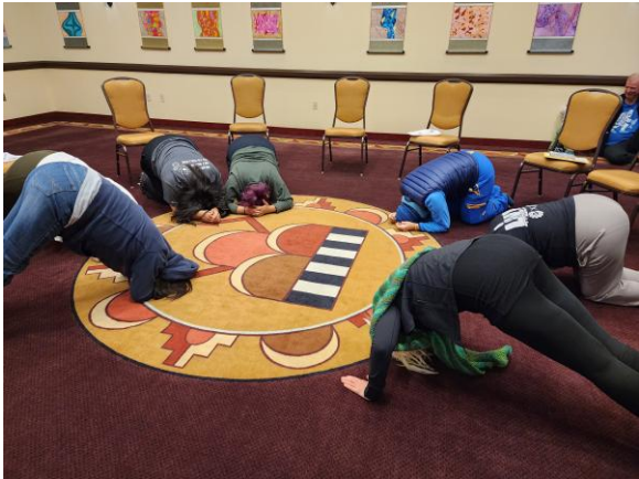
A workshop on how to prevent Parkinson's, Alzheimer's, and dementia with half-head standing