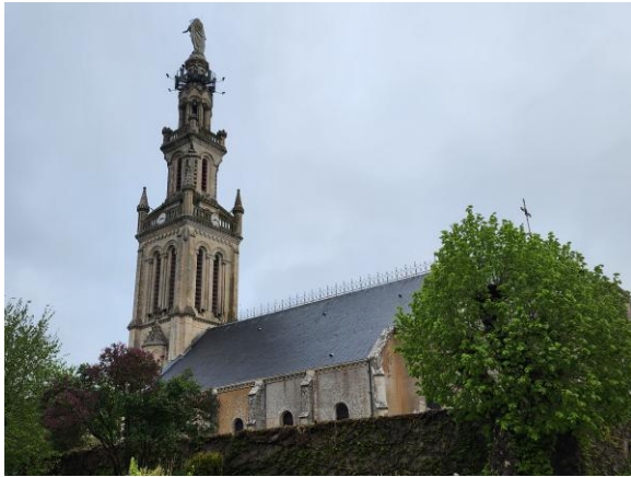
Saxon-Sion Pilgrimage Cathedral