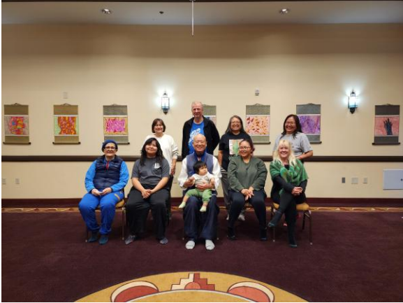
Group photo with many Navajo attendees