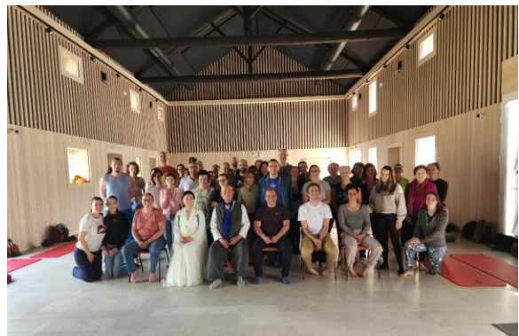
Group photo after trial Sudo practice with the retreat participants and those who were on their pilgrimage