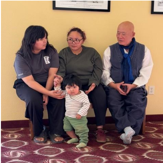
The youngest retreat attendee