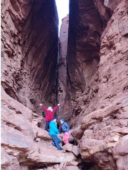
A sacred cave in front of Monument Valley